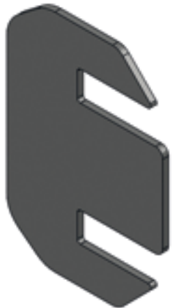
ME3449 X1 LATCH SPACER